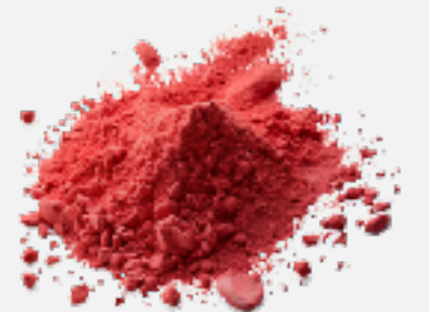
Red algae extract